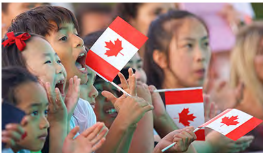
Canada Day Celebrations at Milne Dam Park