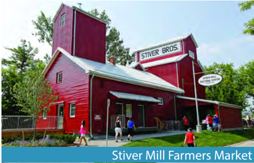
Stiver Mill Farmers Market