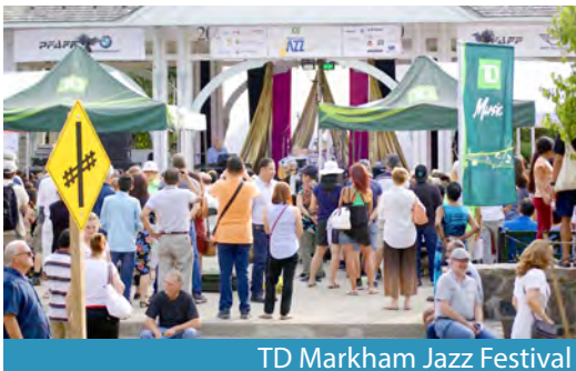
TD Markham Jazz Festival